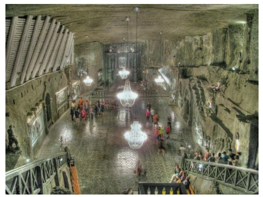
The underground chapel in the Wielizcka Salt Mine in Krakow

Flies are another nuisance; they swarm in every room in tens of thousands and blacken the breakfast or dinner table as soon as the viands appear, tumbling into the cream, tea, wine and gravy with the most disgusting familiarity. But worse than these are the mosquitoes, nearly as numerous and infinitely more detestable to those for whose luckless bodies they form an attachment, as they do to most newcomers; a kind of initiatory compliment which I would gladly dispense with, for most intolerable is the torment they cause in the violent irritation of their mountainous bites