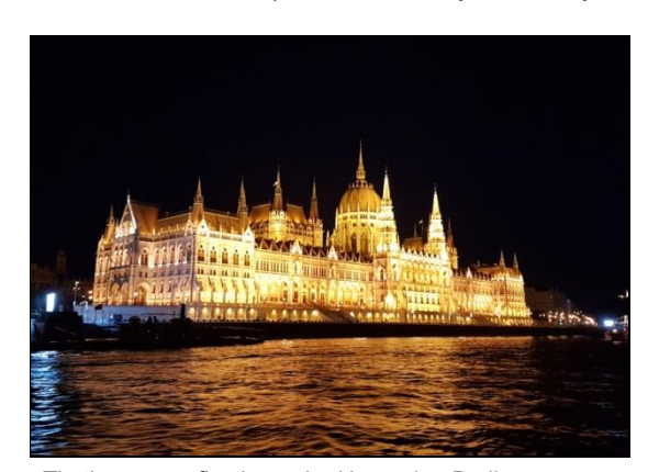
That's some reflection – the Hungarian Parliament building in Budapest.

We followed well worn (and professionally arranged) footsteps through much of Europe and there's not one that we wouldn't retrace, all things being equal. Accordingly we thoroughly recommend the experience to anyone lucky enough to do something similar.